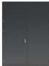
Double Doors and Over Panel