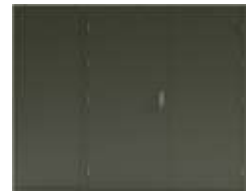
Double Doors and Side Panel