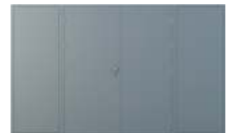
Double Doors and 2 Side Panels