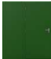
Single Door and Side Panel