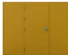
Single Door and 2 Side Panels